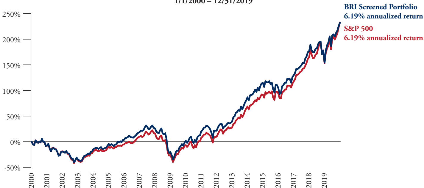
BRI Screened Portfolio Ties the S&P 500 Cumulative Returns of BRI Screened Portfolio vs. S&P 500 1/1/2000 – 12/31/2019

To examine this question, Stewardship Partners carefully assessed the impact of screening the S&P 500 over the last twenty years. The results are reassuring to investors desiring to honor their Lord by aligning their investments with their Christian beliefs. The chart below tracks a portfolio of companies passing comprehensive biblical screens versus the unscreened index. As can be seen, in the long term sin has not won!